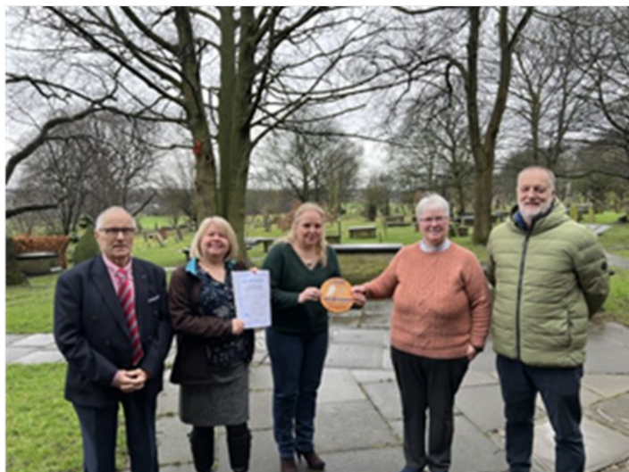
The Environment Team with the Silver Award.